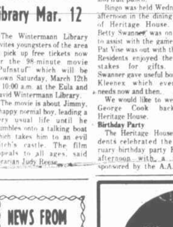
The Wintermann Library invites youngsters of the area to pick up free tickets now for the 98-minute movie "Pufnstuf" which will be shown Saturday, March 12th at 10:00 a.m. at the Eula and David Wintermann Library.